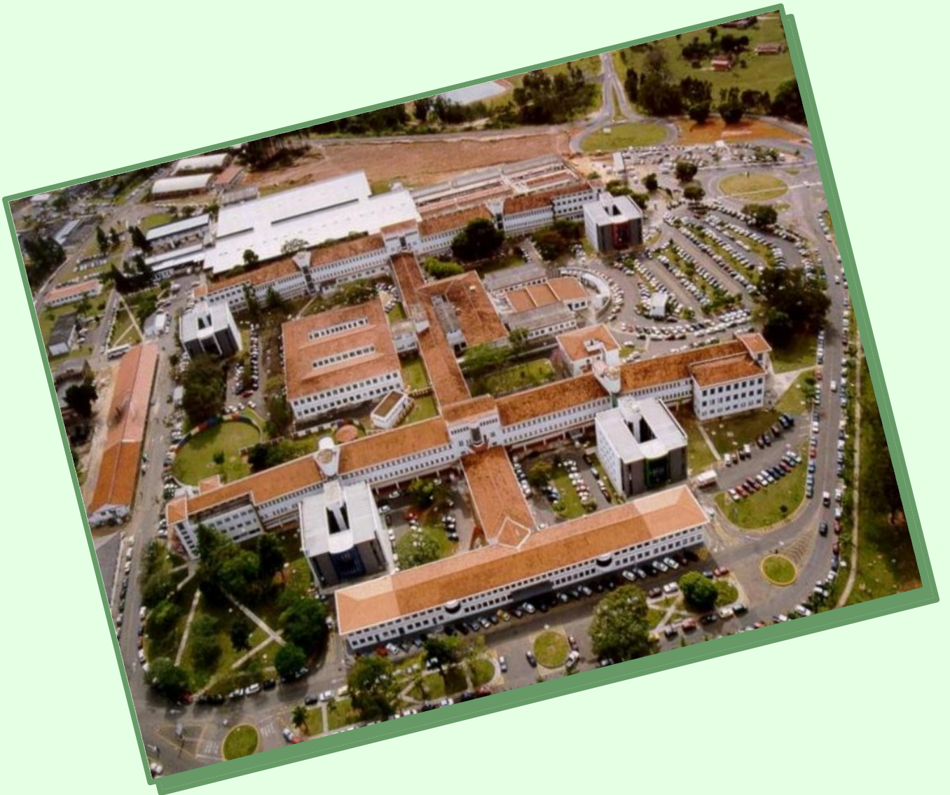
Botucatu Medical School